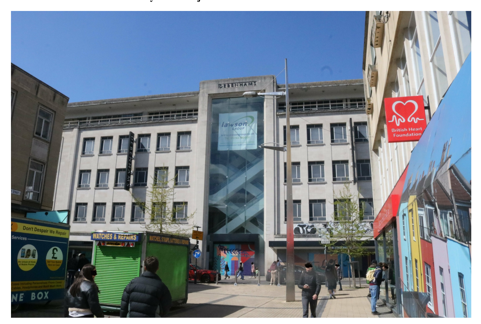
23/04490/F- Former Debenhams & Building to West Horsefair BS1 Revised drawings had been submitted showing small changes to the proposed scheme. However, the Panel considered that these did not address their original concerns set out in the minutes of the meeting held on January 16th, and the comments set out in those minutes stand.