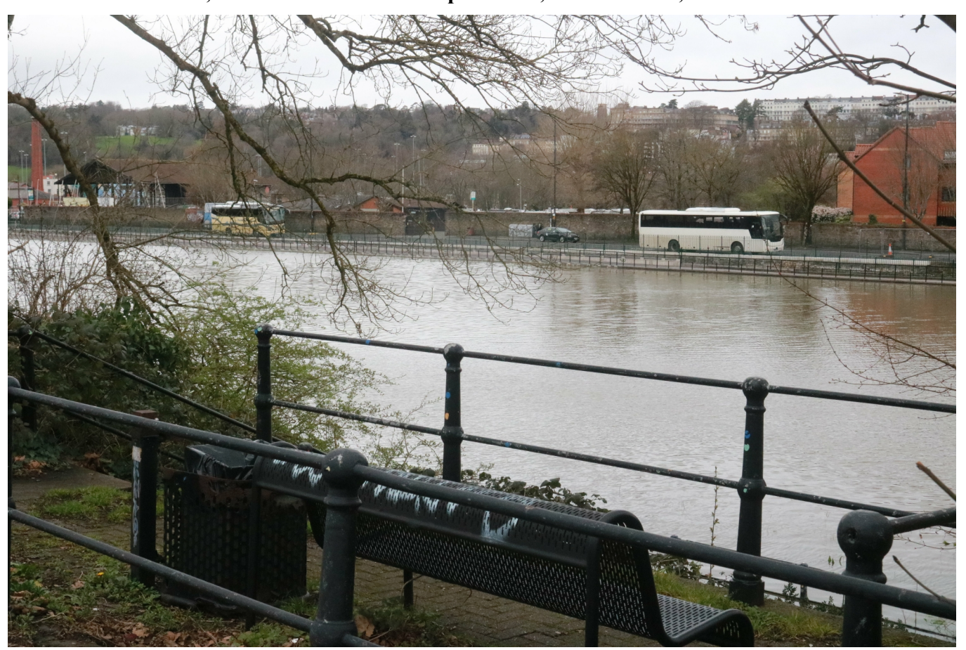
< The site, viewed from Panorama point P28, at street level, Coronation Road BS3 >

The site viewed from the upper panoramic viewpoint CDCA P28 during a different mid-March high-tide in 2024. P28 which at 13m AOD provides a different view North from that at P29 below, including more of the Clifton Escarpment. Tidal Water is seen at Chocolate Path level and flushes twice daily. Note also the winter views late October to March/April are not obstructed by any deciduous trees, the adjacent trees have been pruned by the Council to enhance the view, the Council clears the bin at least weekly, and the benches are in use daily, year round. This is very much part of the City's invisible tourist offer. Built by Bristol City Council 1991, incorporated into detail of CDCA review 2010.